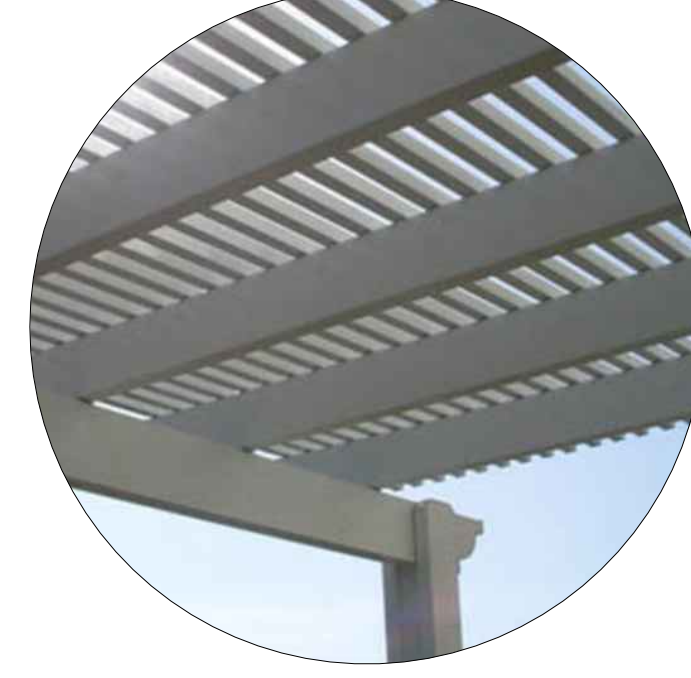
6 ALUMINUM TRELLIS STSTEM / PERGOLA (ANODIZED ALUMINUM COLOR)