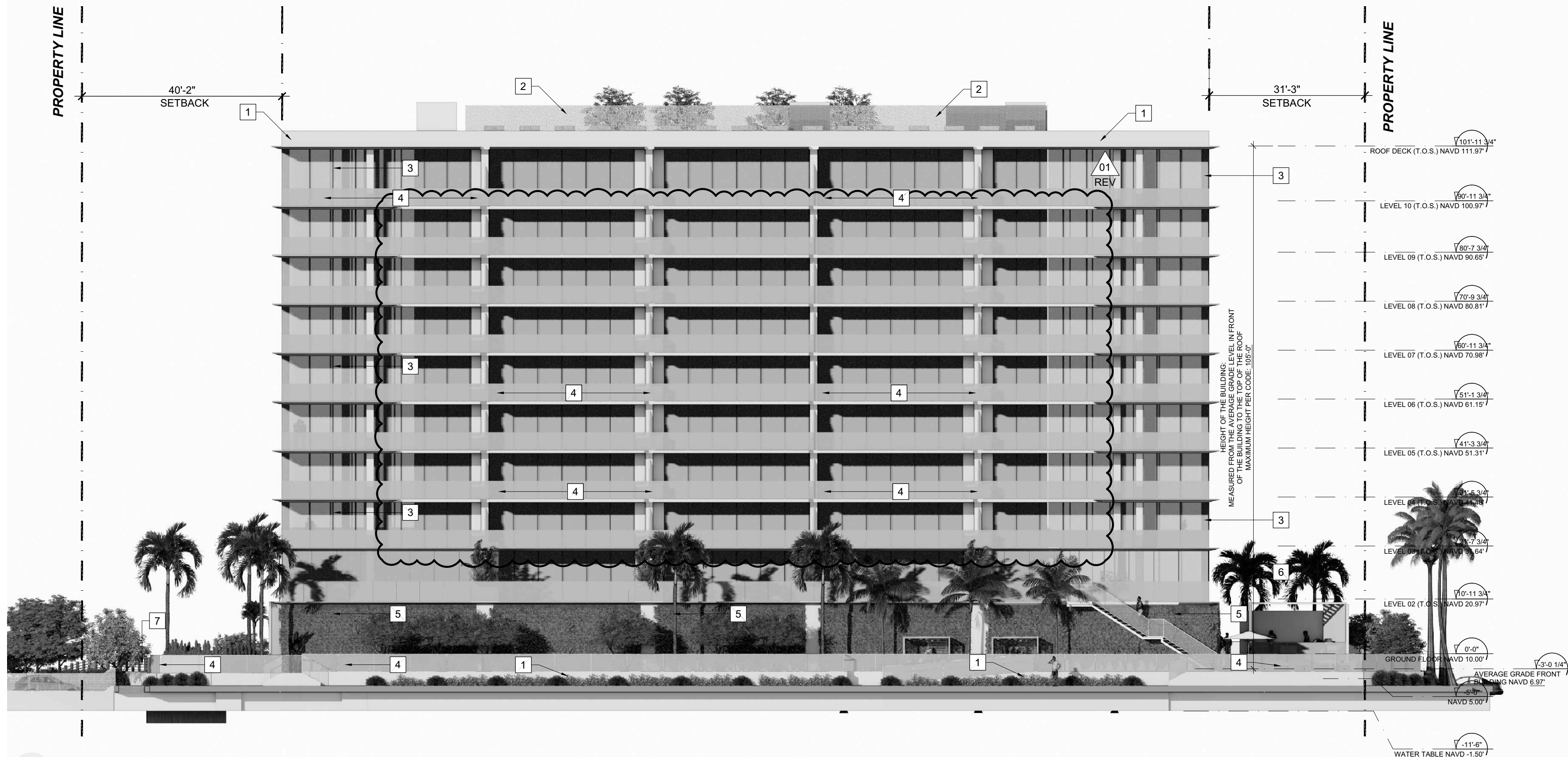
1B REAR ELEVATION (WEST) - AFTER A-502 SCALE:1/16" = 1'-0"