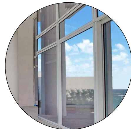
3 VIRACON VLE1-47 LAMINATED GLASS