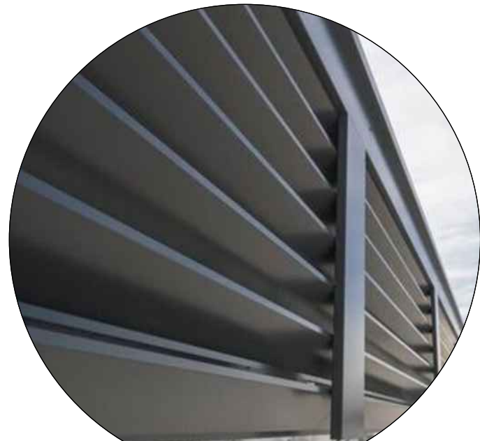
2 MECHANICAL EQUIPMENT ROOFTOP LOUVERED ALUMINUM SCREENS

SW-7005 PURE WHITE SHERWIN-WILLIAMS / OR EQUIVALENT APPROVED BY ARCHITECT