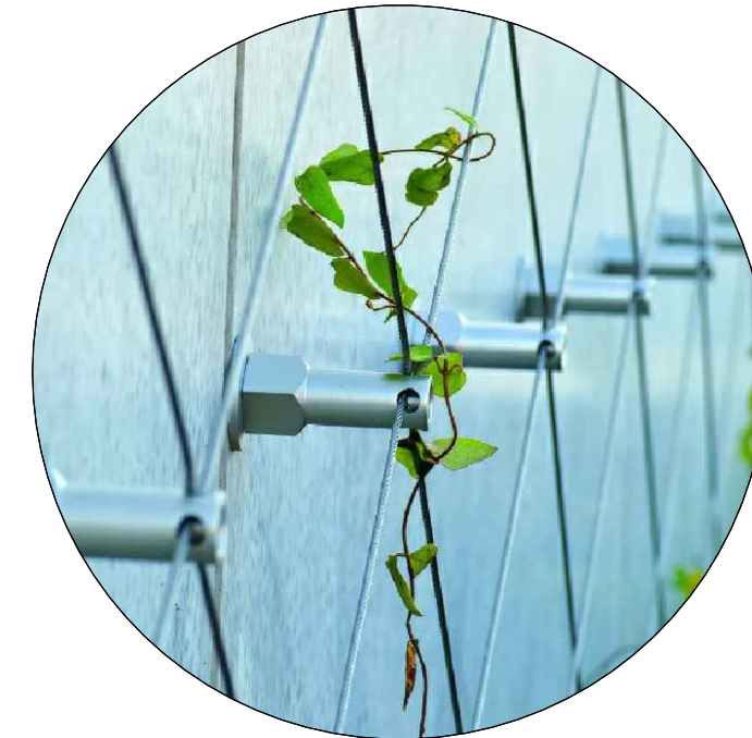
5 GREEN WALL STAINLESS STEEL CABLE TRELLIS SYSTEM