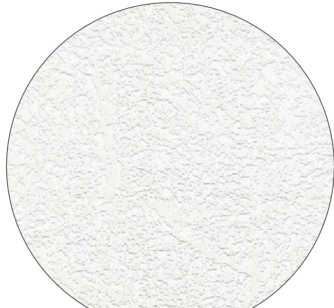
1 SMOOTH STUCCO FINISH