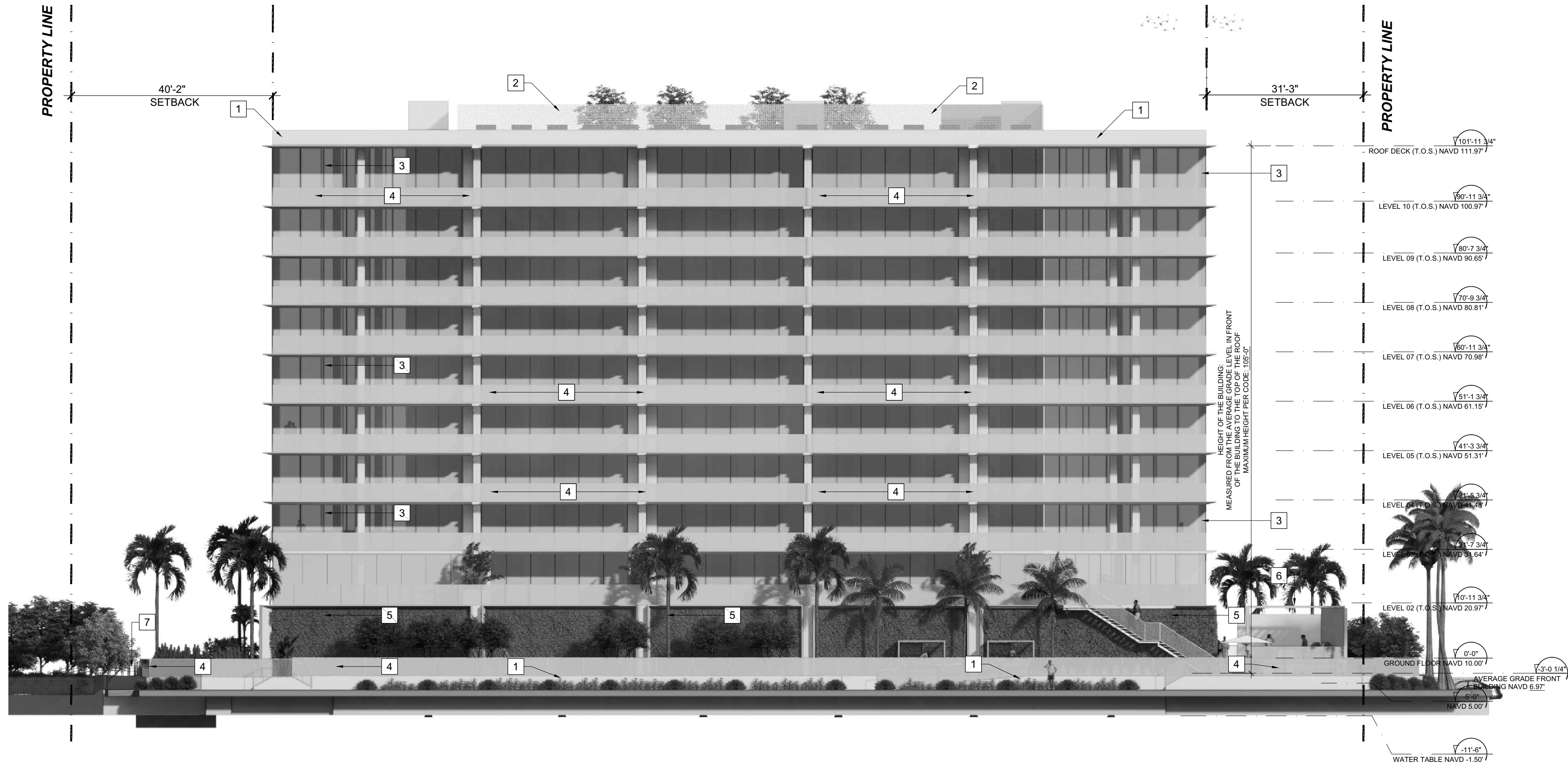
1A REAR ELEVATION (WEST) - BEFORE A-502 SCALE:1/16" = 1'-0"