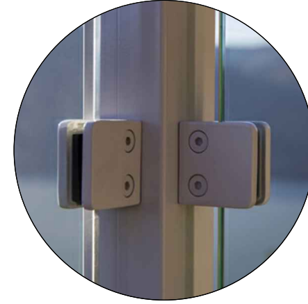
4 FRAMELESS CLEAR GLASS RAILING SYSTEM