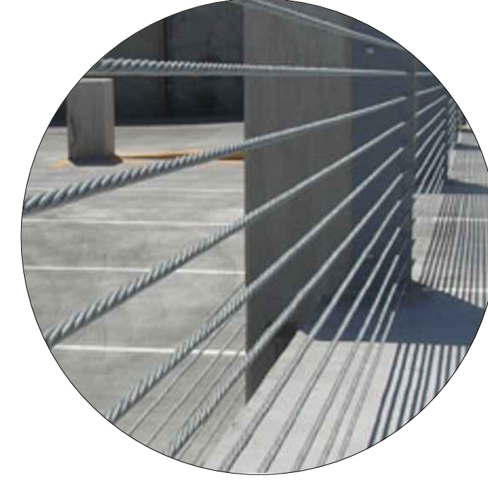
7 42" H. CABLE CRASH WALL (HORIZONTAL WIRES) SHOP DRAWINGS TO BE APPROVED PRIOR TO INSTALLATION